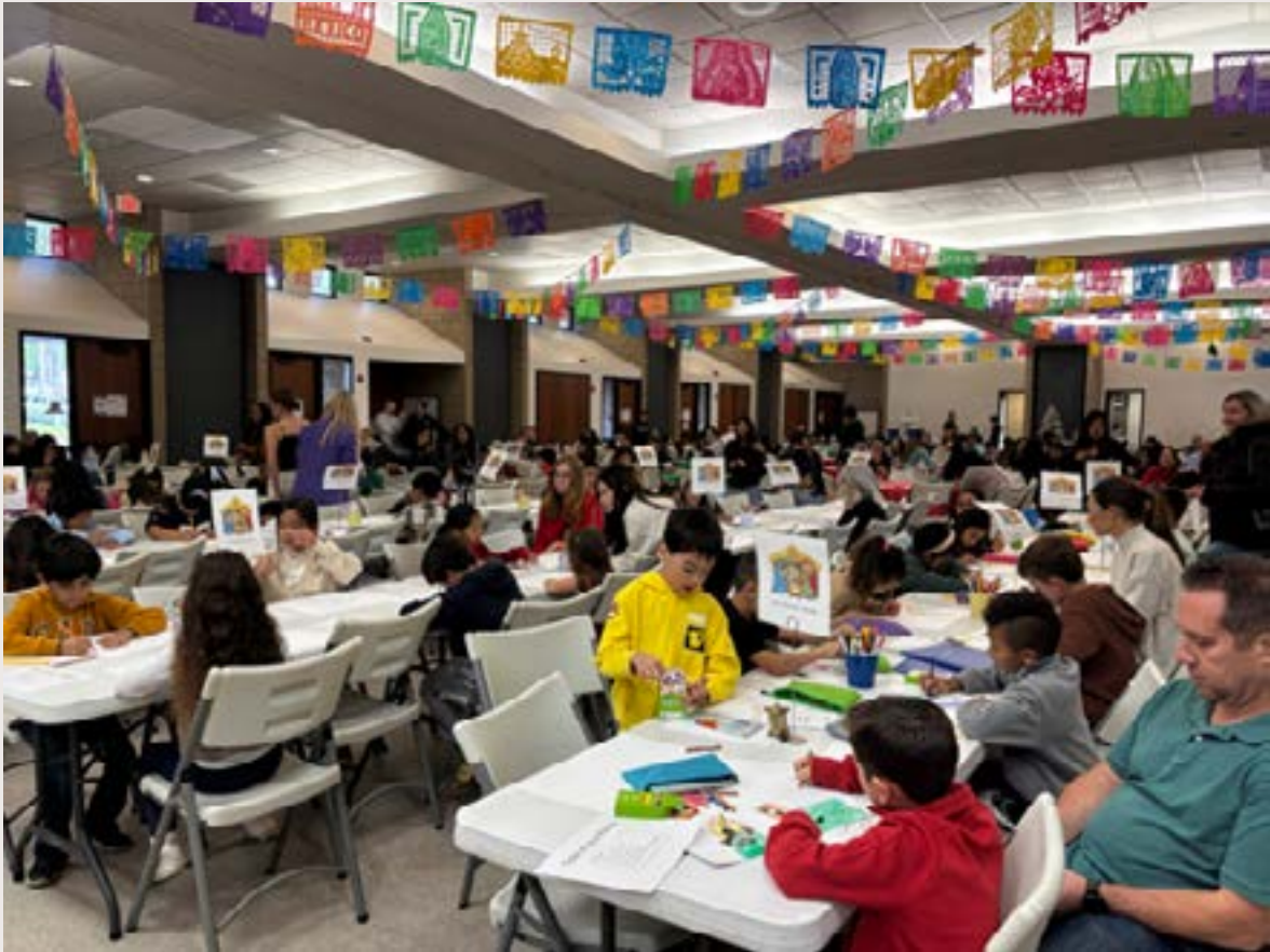
Keep Christ in Christmas Poster Contest